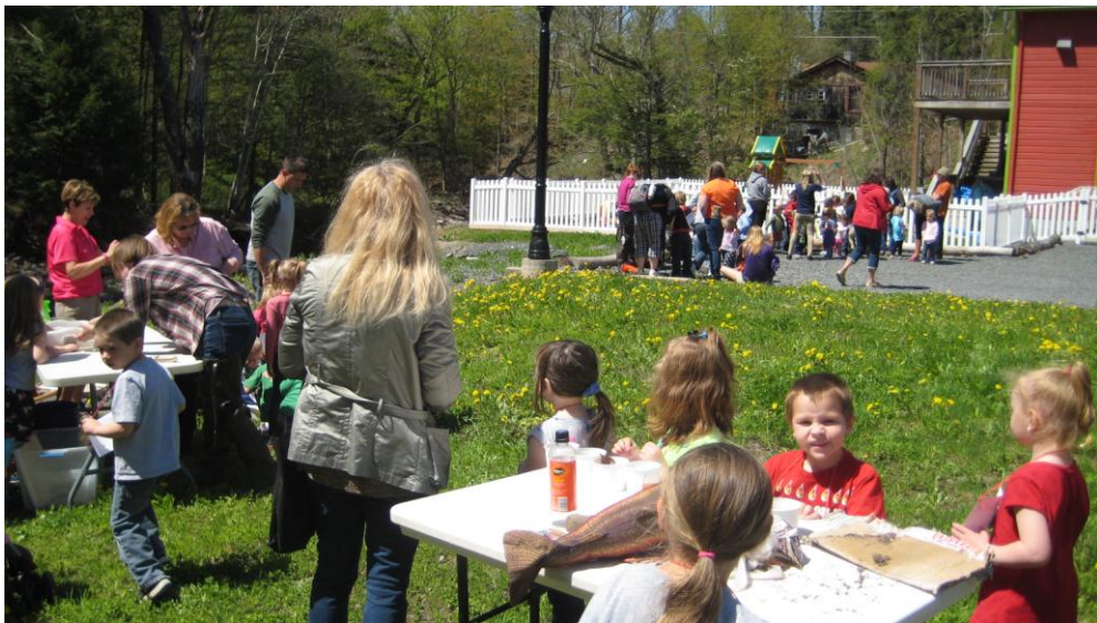
Preschoolers at Mrs. Puddle Duck's along Sawmill Creek

Attended by more than 50 schoolchildren, parents, and teachers, this workshop was designed by Catskill Center staff and featured four learning stations for the children. Using numerous props, including fly nymphs gathered from Sawmill Creek, the pre-schoolers learned the characteristics of healthy (and unhealthy) streams and had great fun. Table themes included sight, sound, and feel, enabling the children to connect with stream resources through participatory exercises. The youngsters wore cards and were awarded stars upon visiting each station and listening to the lessons. A grab bag of water-themed prizes were given out to each child. Snacks were donated by the Hunter Foundation and Mrs. Puddle Duck's Child Care. In addition to the Catskill Center, staff from Greene Co. SWCD and Genius Loci Planning conducted activities at the tables and assisted with the overall event.