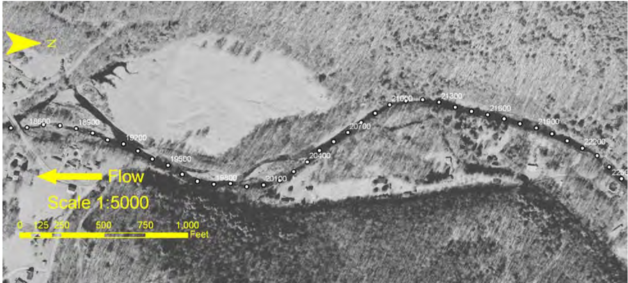
Figure 20 Management Unit 8 Stream Morphology Reference