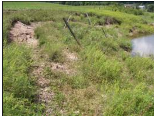
Photo 2.5.4. Hillslope failure in the Manor Kill – notice fence posts moving down with slope.

conditions and water quality. The combination of stream erosion at the top of the hill slope, fluctuating groundwater levels, differential seepage from the slopes and saturated sediment can result in very long-lasting, deep-seated slope failures. Examples abound throughout the watershed (Photo 2.5.4). Every major rainfall-runoff event seems to generate new slope failures or reactivate older failures. Some of the chronic turbidity sources in the tributary streams are from these hill slope failure sources, which can release large volumes of sediment, especially during a storm or other high-water event.