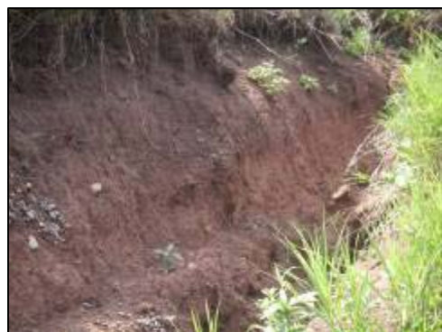
Photo 2.5.7. Lodgement till in the Manor Kill

This is an over-consolidated (very dense), clay-rich, reddish brown deposit that is prevalent in the Manor Kill (Photo 2.5.7). This hard-packed silty clay with embedded pebbles, cobbles and boulders forms a number of steep banks in the drainage basin. Its dense, consolidated character is distinguished from the looser assemblage of mixed sediment sizes (silty sand-boulder) that comprises melt-out till found in moraines and along mountain sides. It is typically exposed in stream channels where overlying lake clay deposits have been