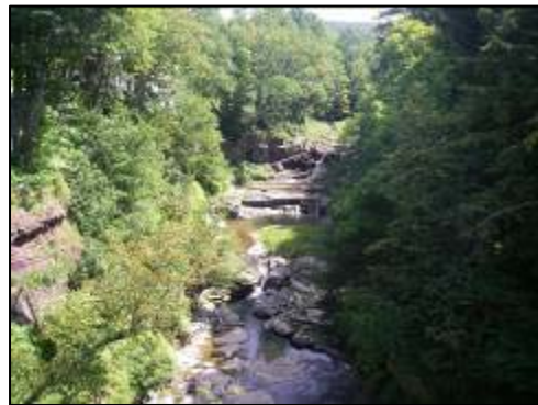
Figure 2.5.8. Lower Manor Kill contains a large amount of bedrock control.

The presence of bedrock sills and banks is an additional geologic unit equally important in characterizing geology for stream corridor management (Photo 2.5.8). These hydraulic controls can represent natural limits to changes in the stream channel system caused by incision or lateral migration. An example is the occasional bedrock stream banks along the course of the Manor Kill, and the large amount of bedrock as the stream falls into the reservoir.