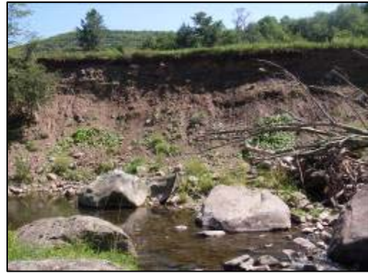
Photo 2.5.1. Streambank erosion into glacial mixed till along the Manor Kill.

Water flows across the landscape and sculpts the watershed. The geology (the earth material) of the watershed helps determine the nature of the streams that form, influences the stream's water quality, and the way the landscape erodes (Photo 2.5.1). In and around the Catskill Mountains, geology is the primary control on water quality. Jill Schneiderman, a professor of geology at Vassar College, notes in her book The Earth Around Us: Maintaining a