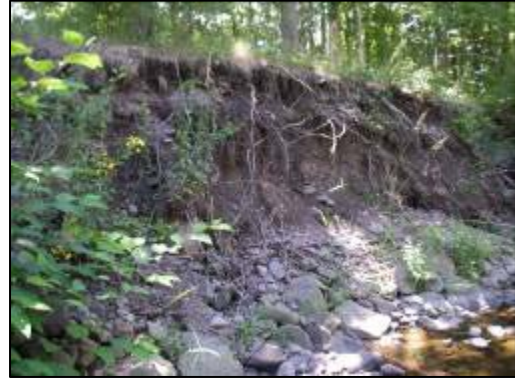
Photo 2.5.5. Coarse fluvial sediment covers many of the Manor Kill's stream banks.

This general term is applied to all unconsolidated deposits regardless of whether they were deposited directly as post-glacial stream deposits, glacial outwash (proglacial fluvial sediments), reworked outwash, kame terrace deposits, melt-out till , moraine deposits or reworked lodgement till (Photo 2.5.5). The unit is composed of sand, gravel, cobbles, boulders and a small clay/silt fraction. The unconsolidated deposits are present in valley centers, typically ranging from four to twelve feet in thickness (Rubin, 1996). With the exception of a thin, weathered mantle often capping it, this is the uppermost geologic unit most commonly forming stream banks. Boulders specific to this geologic unit naturally drop out as stream banks are eroded, providing some aquatic habitat and diversity.