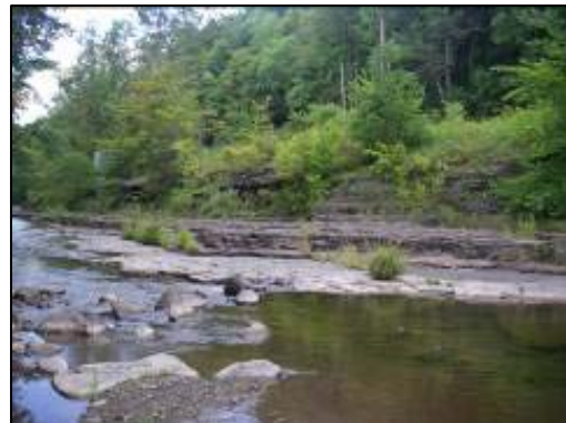
Photo 2.5.2. Bedrock exposed along the Manor Kill

The bedrock geology of the Catskill Mountains and Manor Kill watershed exerts considerable control on the character of its valley slopes and streams (Photo 2.5.2). The sedimentary rock, primarily composed of alternating layers of sandstone and siltstone/shales, creates the characteristic Catskill stepped topography. The sandstones form the cliffs while the more easily erodible siltstones/shales tend to form the slopes. The mountain tops tend to be formed of conglomerate (gravelly sandstone). The sediments that form the middle-to-late Devonian (390 to 360 million years ago) bedrock are interpreted to be deposits of a vast deltaic