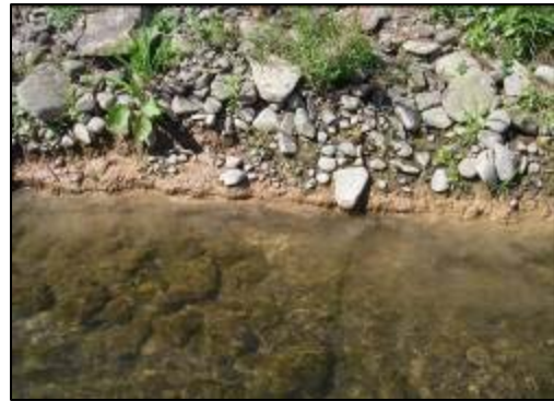
Photo 2.5.6. Clay lens exposed in the Manor Kill

This reddish or pinkish brown, finely-layered, silty-clay deposit floors significant portions of the Manor Kill and its tributaries. It was deposited subaqueously (from streams discharging into one or more glacial lakes) as a sediment blanket draped over underlying till or bedrock. Locally, it was also deposited in smaller impoundments associated with alpine glaciers and moraine dams. It is commonly exposed along the toe of the stream bank, sometimes in the channel bottom (often beneath a thin cover of coarse alluvium), and less frequently as long and/or large banks (Photo 2.5.6).