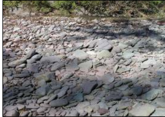
Photo 2.5.3. Example of imbricated Catskill stream sediment

airplane wing and be lifted by the stream flow more readily than would a spherical particle of similar weight. Once this occurs for even a few particles, the imbrication is compromised and significant portions of the streambed become mobile.