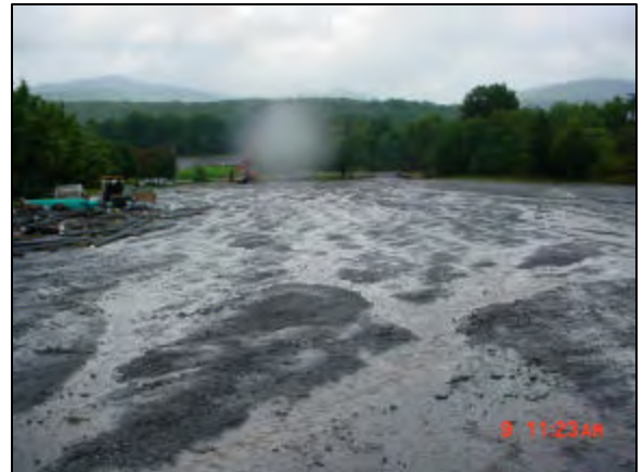
The GCSWCD is working with Windham Mountain to retrofit older development features such as this parking lot to address stormwater quality. Note the extensive rill erosion and loss of sediments.