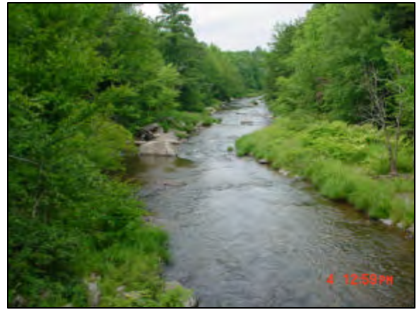
An effective riparian buffer zone (above) will have a variety of deep rooted woody trees and shrubs as well as herbaceous plants growing in various zones of the stream corridor, while a riparian buffer zone in poor condition (below) often does not contain the deeper rooted woody plants that are essential for bank stability.

Programmatic Resources - development of task force for review of stream disturbance permit applications; development of guidelines which integrates stream form and function for use during periods of flood response; and evaluation of municipalities existing land use regulations and adoption of stream corridor protection provisions.